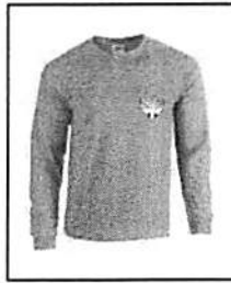
Long Sleeve T-Shirt Grades K-7