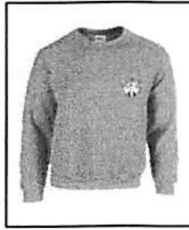
Crewneck Sweater Grades K-7