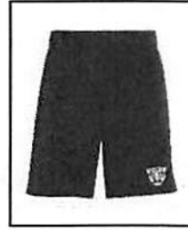
Gym Shorts Grades 3-7