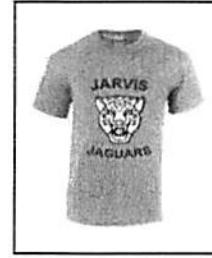
Gym T-Shirt Grades 3-7