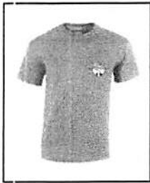
Short Sleeve T-Shirt Grades K-7

Student Name: _____ Grade: _____ D.O.B: _____